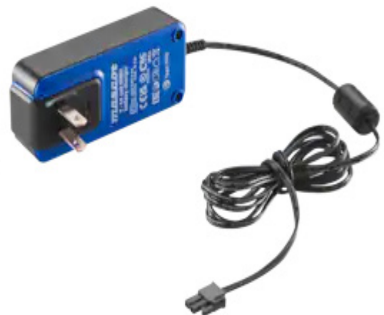
Oasis Battery Charger