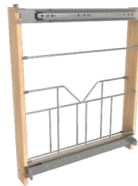
448BSKT3C Sidekick Pullout Tray/Foil Wrap Holder