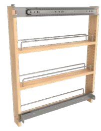
448BSKS3C Sidekick Pullout Spice Holder