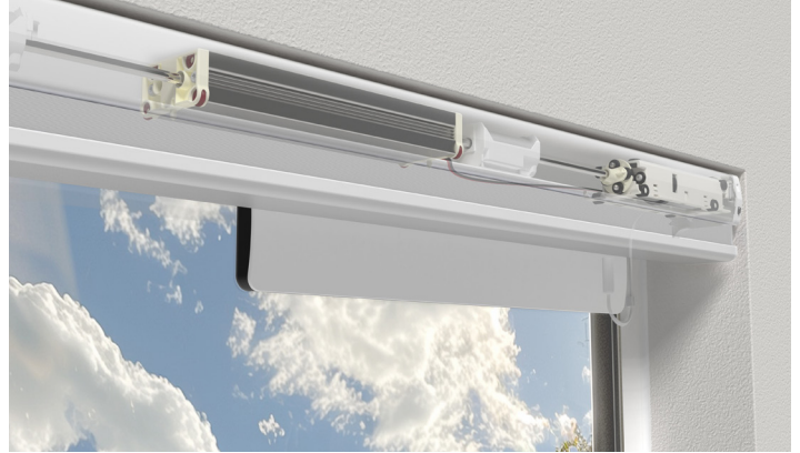
Stacking Internal Rechargeable Battery