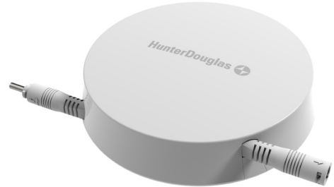
Retractable Charging Cable