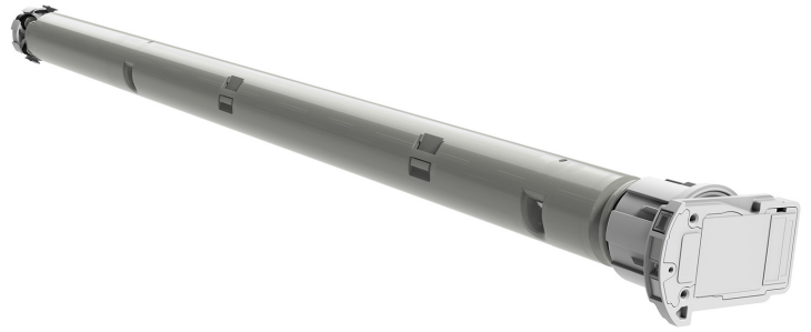
Rolling Internal Rechargeable Battery