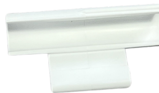
Specialty Shapes Charging Clip