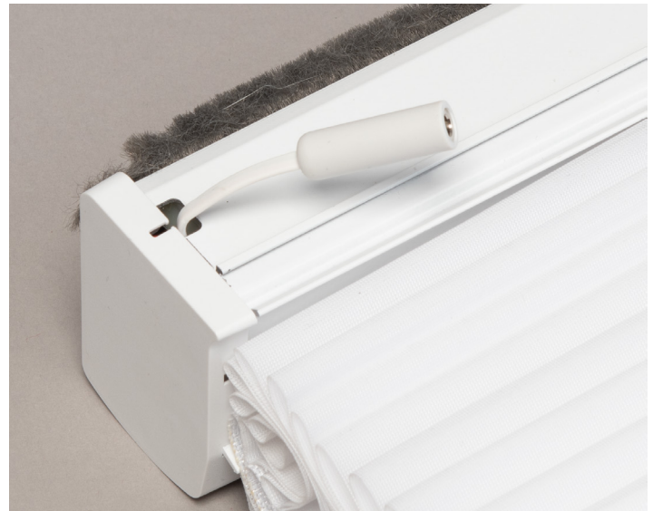
Y Solar Adapter Cable (for stacking IRB)

NOTE: When ordering Duette Vertiglide™ with IRB, the included cable assembly is designed to be compatible with the Solar Charger Kit. No additional adapters are required. For Vertiglide products built 11/25/2024 and later, a Vertiglide IRB Retrofit Cable can be purchased from Parts to convert an external RBW to IRB. This retrofit cable assembly is also compatible with the Solar Charger.