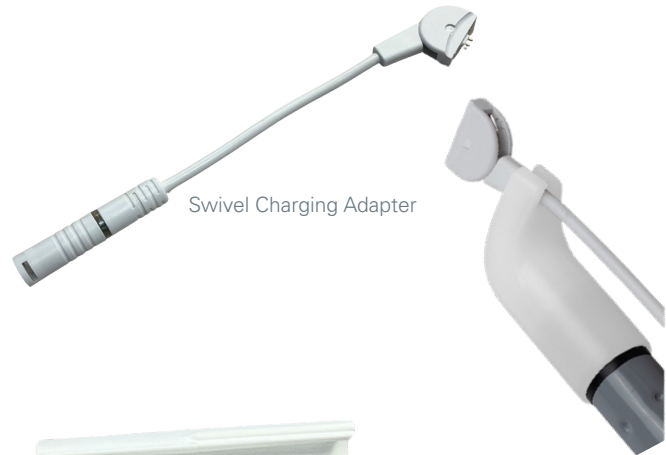
Swivel Charging Adapter